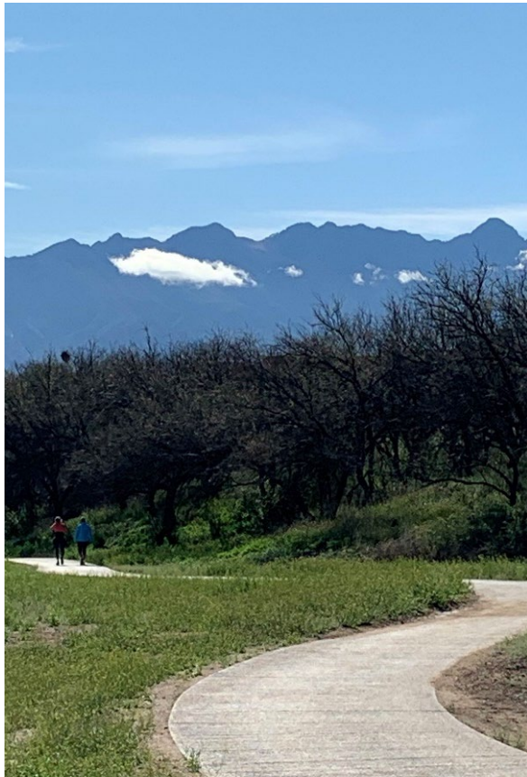
The Council partners with its affiliate, the GVC Foundation and Pima County to help develop and promote the three Canoa, Pima County parks in Green Valley. Walkers enjoy the Canoa Hills Trails Park, a converted golf course, open urban park.