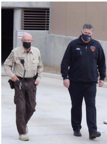
The Council partnered with the Green Valley Fire District and Pima County Sheriff's Auxiliary Volunteers to vaccinate 3,000 Green Valley residents against Covid-19 in February/March 2021.

Over 90% of the population live in HOAs (Homeowner Associations). In 1973, the HOAs incorporated as the Green Valley Council to serve as liaison with Pima County in order to ensure that the interests, needs, and general welfare of unincorporated Green Valley were fully considered by Pima County's governmental departments and agencies.